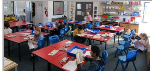
In Hares Class we created our own Mr Men and Little Miss Characters, then created our own little books with a story about the characters, we also took our stories to read to some of the Year Ones and also joined in with the CBeebies Big Live Read where we read at the same time as lots o other children all around the UK.